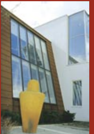
Sculpture "Portrait" by Anitta Toivio was created in 1996 during the symposium of ceramic sculpture. Kankaanpää Art School 1995, Architect's Office Kouvo & Partanen.