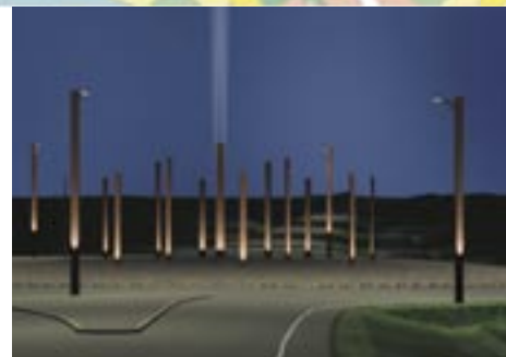
"Forest of Light" by Roope Siirainen will be completed in Kankaanpää intersection in 2007.

The works placed outside the Circle of Art and the Path of Art (shaded route on the map) are marked on the map. On the map below there are marked those works of art along the Pori - Kankaanpää Art Route that are situated on the area of Kankaanpää and also the works of art outside the town centre. Map of the Circle of Art and list of works are shown on the centrefold.