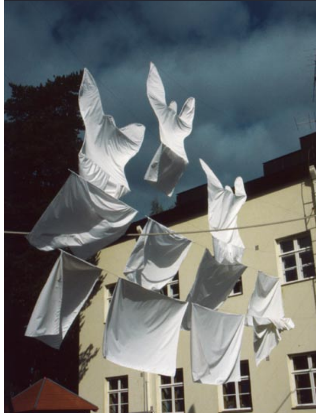
Erja Honkanen: Laundry day. Exhibition "Again" 1998.