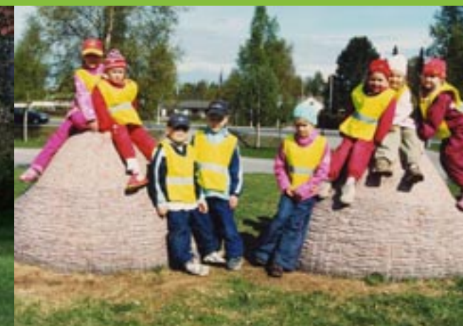
"Untitled" by Latvian artist Pauls Jaunzems functions as a meeting point at Rimpiranta. Children from the day nursery on a spring time expedition.