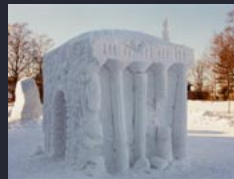
Snow and ice have inspired sculptors of Kankaanpää Art School to create works in Kankaanpää and neighbouring towns on a yearly basis.