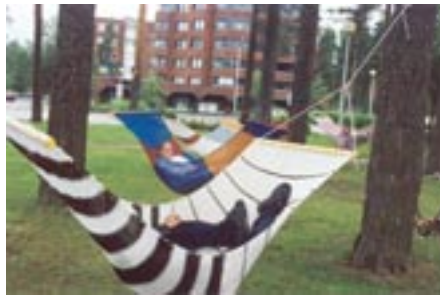
Textile works of the exhibition "Ends of cloth" coloured the townscape in summer 2002. On the left "Five Swings in the Park" by Ulla-Maija Vikman, on the right the work "Everyday Dreams" by Maiju Ahlgren.