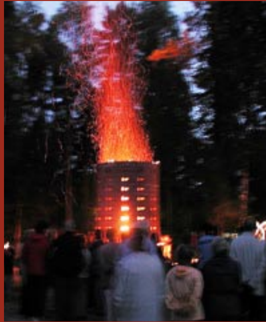
Pekka Paikkari: The Kiln 2003.